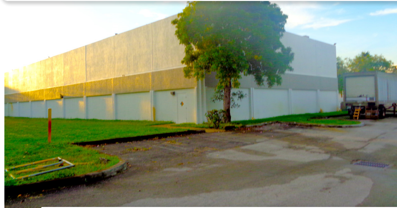
CORAL SPRINGS CORPORATE PARK